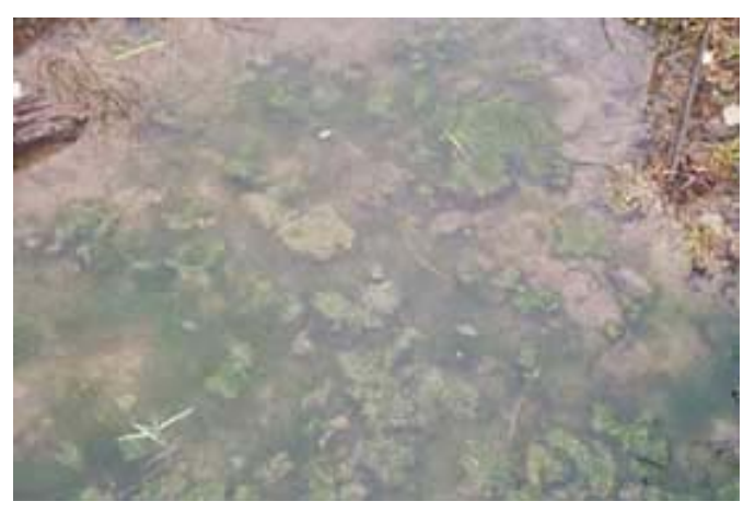
Clumps of algae in a stream

Call the Department of Planning at 914-995-4400 if you have a concern with algae.