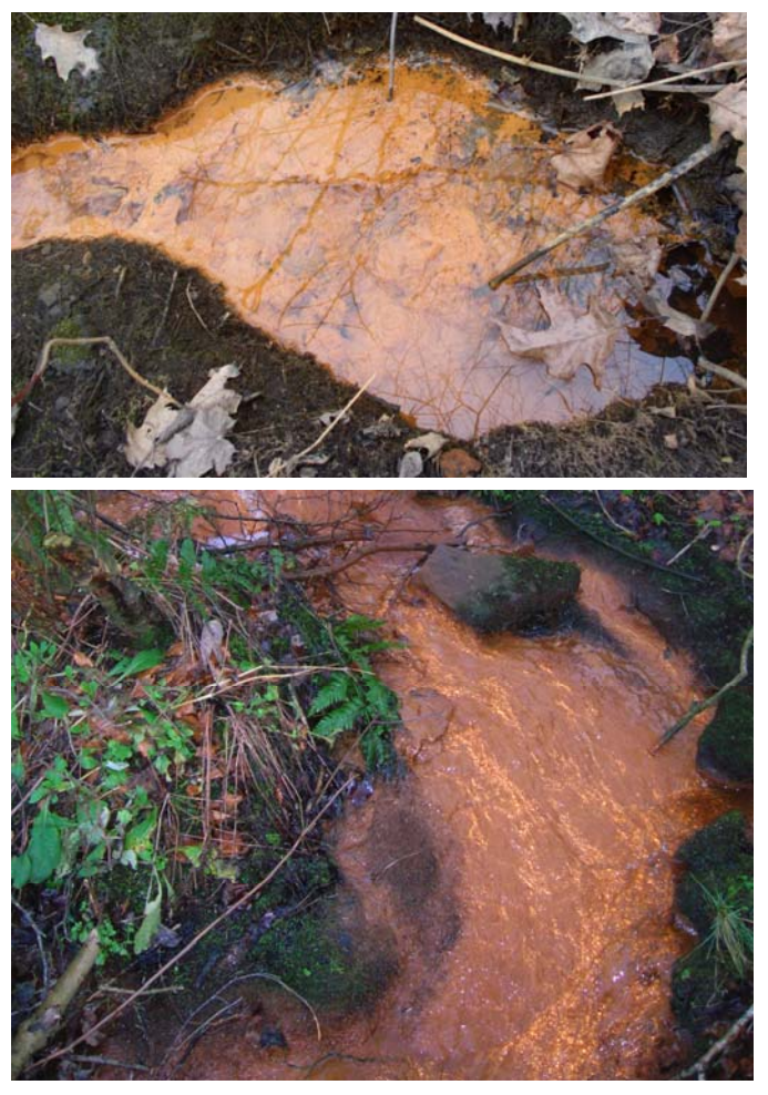
Iron Bacteria Photos: en.wikipedia.org/wiki/Iron_bacteria

Greenish spongy-looking clumps attached to submerged sticks and plant stems in clear, welloxygenated lakes might be freshwater sponges. There are about 150 species of freshwater sponges, which are often mistaken for aquatic plants or algae. Most sponges are green, because they have algae living in their tissues. Freshwater sponges vary in size from a less than an inch to three feet. They are most commonly seen in summer or fall. They may appear sporadically and be abundant in a lake one year and absent the following year. They are usually finger-shaped, and can look soft or hard. Sponges are strong enough to be picked up without falling apart, unlike many kinds of algae.