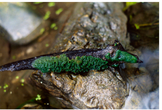
Fresh Water Sponge Photos: http://dnr.wi.gov/org/es/science/citizen/