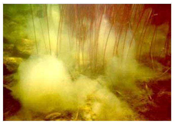
Metaphyton clouds in a lake.