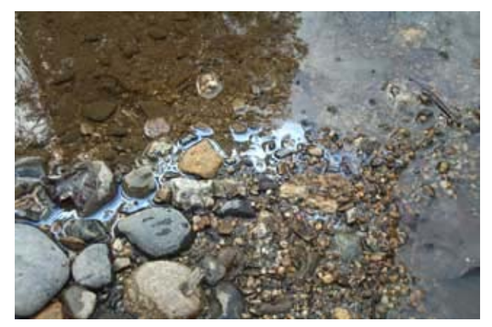
Natural oily sheen