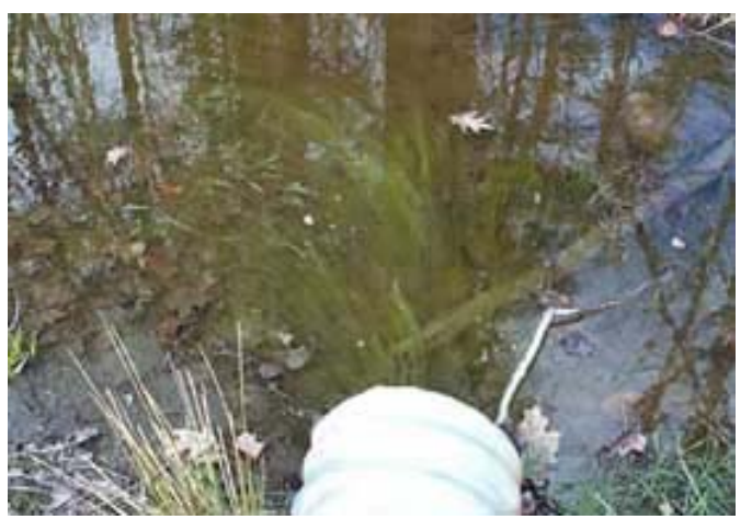
Strands of algae from a drainage pipe