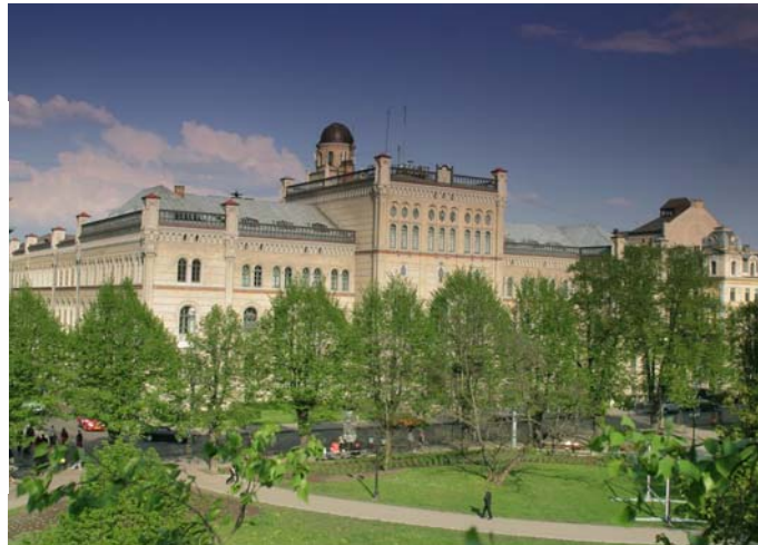
University of Latvia

The University of Latvia was founded in 1919 on the basis of the former Riga Polytechnic (founded in 1862). In 1923 this school received its present name - the University of Latvia (Universitas Latviensis). The former building of Riga Polytechnic is located at 19 Raina Boulevard and serves as the symbol of the University even nowadays.